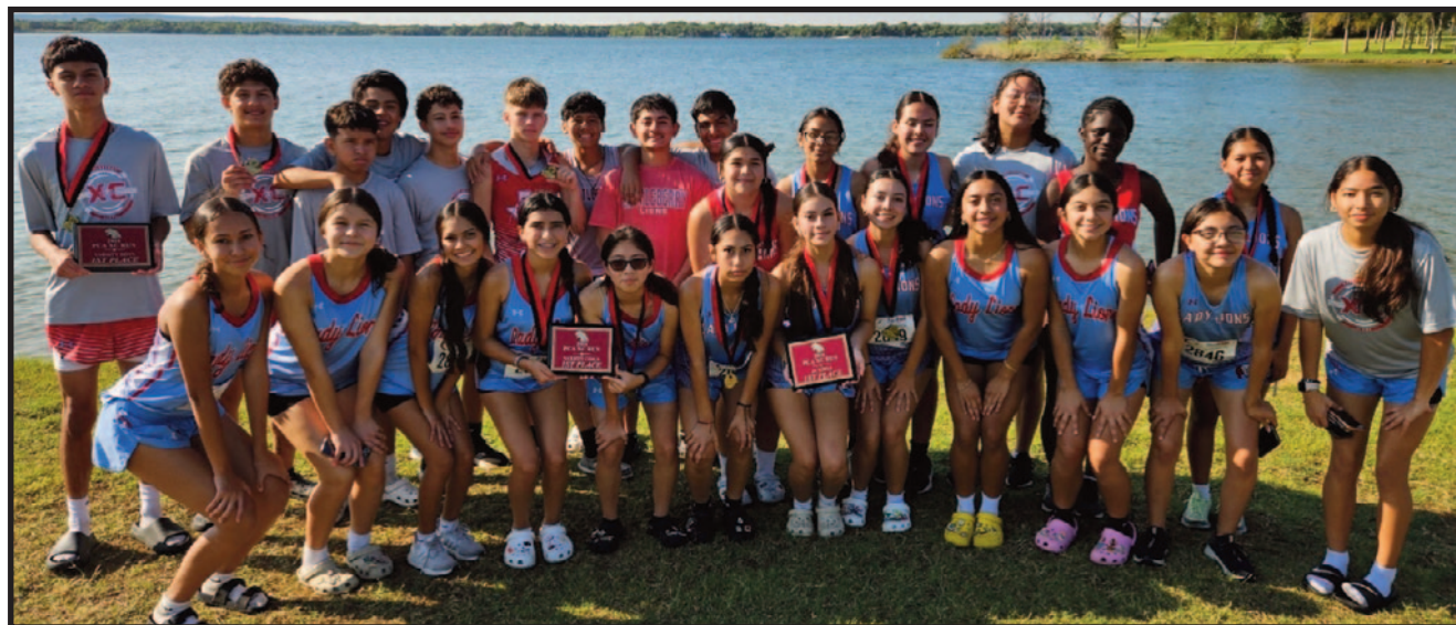
The Castleberry Varsity Boys, Varsity Girls, and JV Girls Cross Country teams took first place at the Grand Prairie meet on Sept. 6.