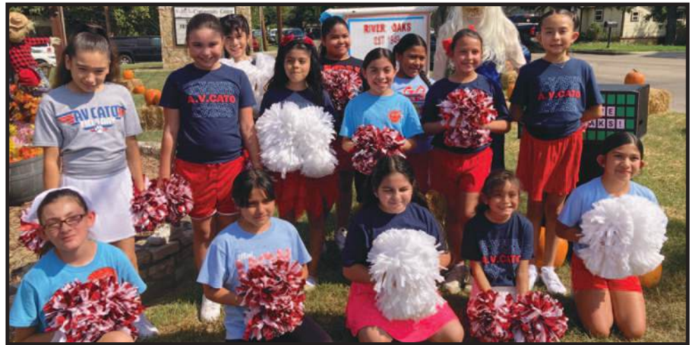
The A.V. Cato Elementary after school Cheer group performed for the first time together.